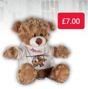
2508. 10" Huggable Bear Wearing an EAAA Hoodie