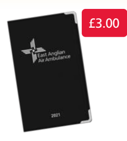
19207. EAAA 2021 Wallet Diary Handy fold-flat diary for 2021 (approx size 103mm x 168mm)