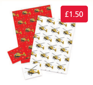
2759. Helicopter Wrapping Paper Pack includes two sheets, one of each colour and two tags (700mm x 500mm)

More gift items are available online at: